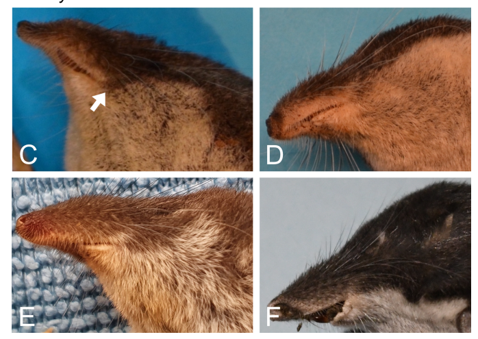
Figure 1 – Examples of the shape of the facial line of demarcation in Neomys fodiens (a, b) and N. milleri (c – f) in here examined museum specimens from Switzerland. The facial line of demarcation (arrow in a) marks the sharp transition between the dark greyish fur on the dorsal side of the head and the lighter coloured fur on the ventral side. In N. milleri (c – f) the dark facial mask usually involves the corner of the mouth, even exhibiting a convexity (arrow in c), while in N. fodiens (a, b) it does not. See text for detailed descriptions of the inter- and intraspecific variation of the shape of the facial line of demarcation. a) N. fodiens , BNM 404 (genetically determined, Grisons, photo mirrored); b) N. fodiens , NMSC-V-7992 (genetically determined, St.Gallen, photo mirrored); c) N. milleri , BMN 16840 (genetically determined, Grisons); d) N. milleri , BMN 17117 (genetically determined, Grisons); e) N. milleri , Grisons); f) N. milleri , BMN 17117 (genetically determined, Grisons); d) N. milleri , BMN 17112 (genetically determined, Grisons).

Adrian Dietrich (AD, n=1); Bündner Naturmuseum, Chur, Switzerland (BNM, n=34); Muséum d'histoire naturelle, Genève, Switzerland (MHN, n=95); Naturhistorisches Museum Bern, Switzerland (NMBE, n=30); Naturmuseum St.Gallen, Switzerland (NMSG, n=27); Museum of Zoology, University of Cambridge, United Kingdom (UMZS, n=1); Naturmuseum Solothurn, Switzerland (ZMK, n=1).