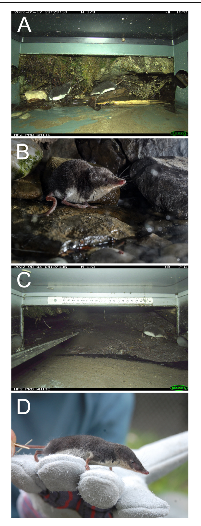
Figure 3 - The shape of the facial line of demarcation in life Neomys fodiens and N. milleri is discernible on camera trap footage (a, c) and in captured animals (b, d). According to the species-specific diagnostic feature as proposed by Lapini et al. (1995) and further evaluated in the current study, these specimens could be determined as N. fodiens (a, b) and N. milleri (c, d), respectively. Camera trap footage (a, c) was obtained using a Reconyx HyperFire2 Professional White Flash Small Mammal Camera built into a MiniMammalCamBox (Vinciguerra, 2022) in the canton of St.Gallen (CH). The specimen in b) was captured in the canton of St.Gallen, subsequently genetically analysed, and determined as N. fodiens; photo: C René Güttinger, RGBlick. The specimen in d) was captured during a project conducted by UNA (unabern.ch) in the canton of Uri (CH), subsequently genetically analysed, and determined as N. milleri; photo: ⓒ Adrian Dietrich..

lateral view. This convexity might be only faintly visible (Fig. 1d). In other cases, this convexity is less conspicuous, but the stripe of white fur on the rostrum, in between the line of demarcation and the upper lip of the mouth, is exceedingly dorsoventrally narrow and/or anteroposterioryl shortened (Fig. 1e, f) or totally absent (Fig. 1f), so that the line of demarcation touches large portions of the upper lip, including the labial angle (Fig. 1e, f). In sum, the dark facial mask of N. milleri usually involves the corner of the mouth, while in N. fodiens it does not (Lapini et al., 1995).